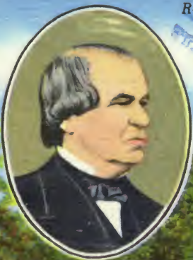
ANDREW JOHNSON, PRESIDENT OF UNITED STATES FROM 1865 TO 1869, RALEIGH, N. C.